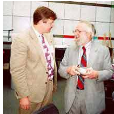
With Dr. Seymour Papert at M.I.T.

He was asked by CIDA, the Canadian International Development Agency and the World Bank to present his thoughts and his work at the Global Knowledge '97 conference in Toronto on the topic of "Universal Access to Information and Communication Technologies", see http://www.inukshuk.com/gk-97.html . At this conference, former World Bank President, Mr. James Wolfenson, praised the impact of this work. He has also been an advisor to the Inter-American Development Bank (IDB) and the U.S. Peace corps. His pioneering work has been featured at an exhibit at the Canadian Museum of Civilization as one of Canada's "Global Heroes".