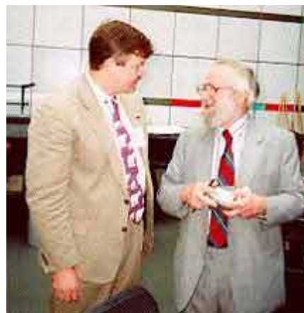
With Dr. Seymour Papert at M.I.T.

He was asked by CIDA, the Canadian International Development Agency and the World Bank to present his thoughts and his work at the Global Knowledge '97 conference in Toronto on the topic of "Universal Access to Information and Communication Technologies", see http://www.inukshuk.com/gk-97.html . At this conference, former World Bank President, Mr. James Wolfenson, praised the impact of this work. He has also been an advisor to the Inter-American Development Bank (IDB) and the U.S. Peace corps. His pioneering work has been featured at an exhibit at the Canadian Museum of Civilization as one of Canada's "Global Heroes".